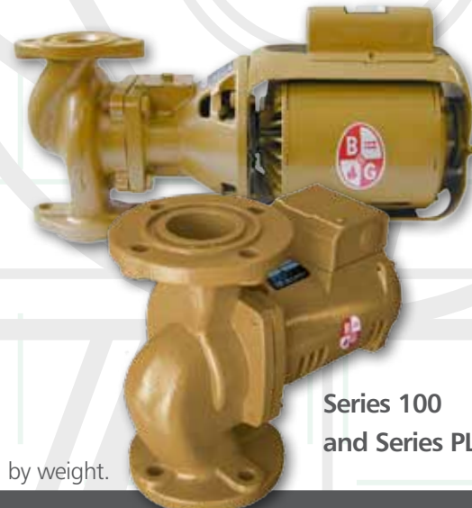
Series 100 and Series PL