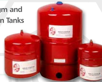
Diaphragm and Expansion Tanks