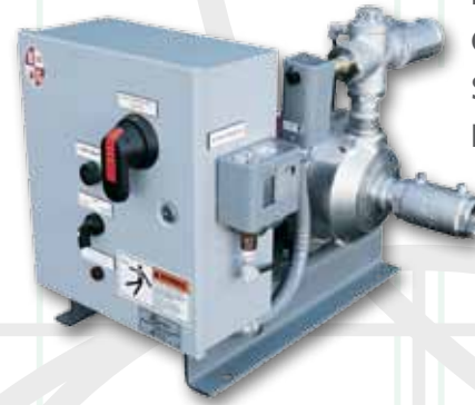
MiniBooster Constant Speed Booster Package