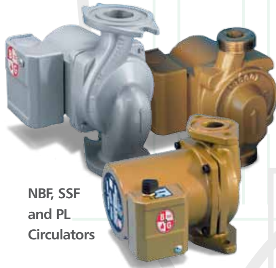
NBF, SSF and PL Circulators

Now our pumps, circulators, flanges, tanks, valves and boosters intended for potable water applications are made of lead-free brass materials. They meet the requirements of California's AB1953 and Vermont's S152 legislation, and exceed current requirements in the other 48 states.